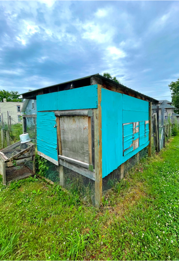
Big Muddy Chicken Coop on 33rd & Webster

Qualifications for nominations to be an officer are: 1. The nominee must be a member in good standing of the Association; 2. The nominee must signify prior consent to serve if elected; 3. The nominee must have attended at least four (4) meetings of the Association in the preceding year.