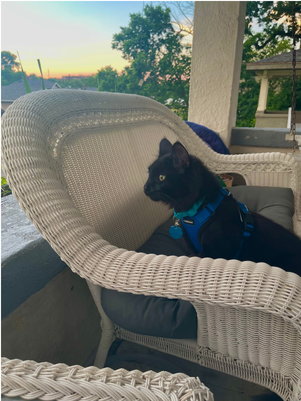
Dr.Harold Gifford's (the cat) first look at Gifford Park Neighborhood